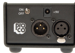
BACK OF UNIT